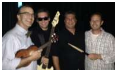
The PVHS Teacher Band

CHS Agriculture & the Henshaw Farm: The students did a great job growing cranberry beans this year - they yielded 25,000 pounds field weight. This is a very high yield and even more impressive when the growing conditions are taken into consideration. The seeds were germinating in the hottest week of the summer, coming through the soil in 105 degree weather with the soil surface itself at 120 degrees. Thank you to the Friends of Ag for their ongoing support of the farm. Their farming advice during trying conditions ensured positive results at the farm. Thank you also to the Ag instructors for their support of our students.