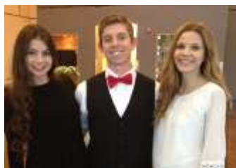
The Music Benefit Leaders